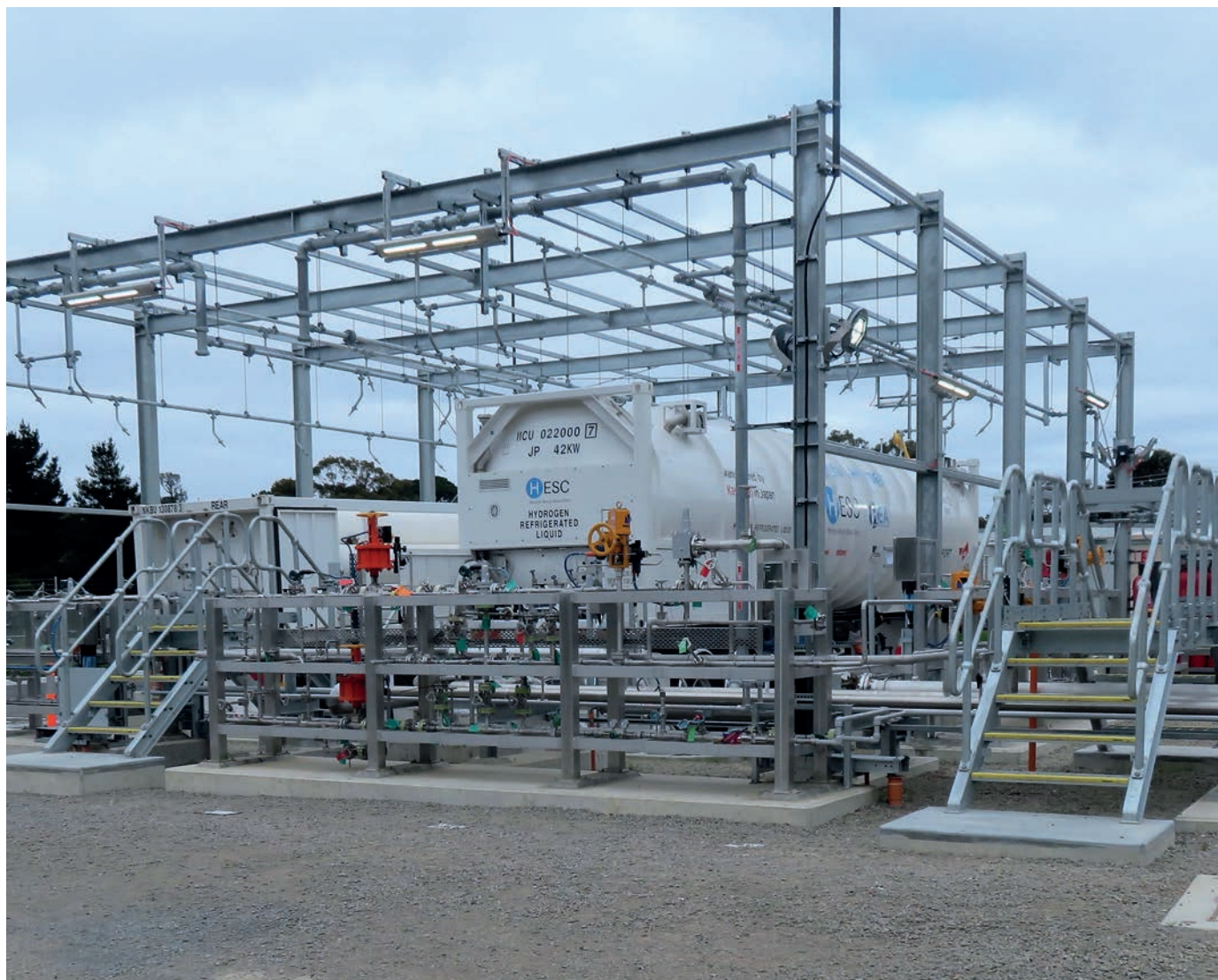
Pilot scale hydrogen production project in Hastings, Victoria, Australia

This means including these sectors in the pilot projects aimed at scaling up hydrogen production, storage and end-uses, and increasing the products, markets, skills and knowledge base needed to do so. Pilot projects and any further roll out of hydrogen technologies should be partnered with public engagement aimed at developing people's understanding of this new energy vector and its use in the sectors where it is adopted. This will allow these otherwise hard-to-decarbonise sectors to take advantage of the increasing availability of hydrogen, achieve immediate emission reduction and be a successful part of the net zero transition.